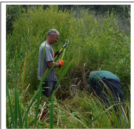
Photo top: Veg pruning along the Fence Photo left: Willow-chopping